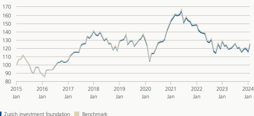
Performance (gross of fees, indexed)

The portfolio invests in participating securities and rights that are included in the MSCI Emerging Markets Index (NR). By replicating the benchmark, performance before deduction of costs is intended to correspond as closely as possible to that of the reference index.