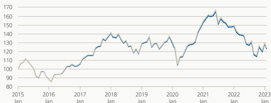
Performance (gross of fees, indexed)

■ Zurich investment foundation ■ Benchmark