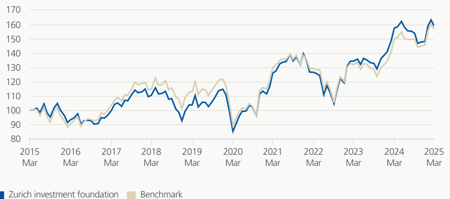
Performance (gross of fees, indexed)

The investment group invests preferably in equities of first-class European companies (excluding Switzerland) with a local and international field of activity, which may benefit from current market developments to an above-average extent.