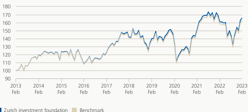
Performance (gross of fees, indexed)

The portfolio invests in participating securities and rights that are included in the MSCI Europe ex Switzerland. By replicating the benchmark, performance before deduction of costs is intended to correspond as closely as possible to that of the reference index.