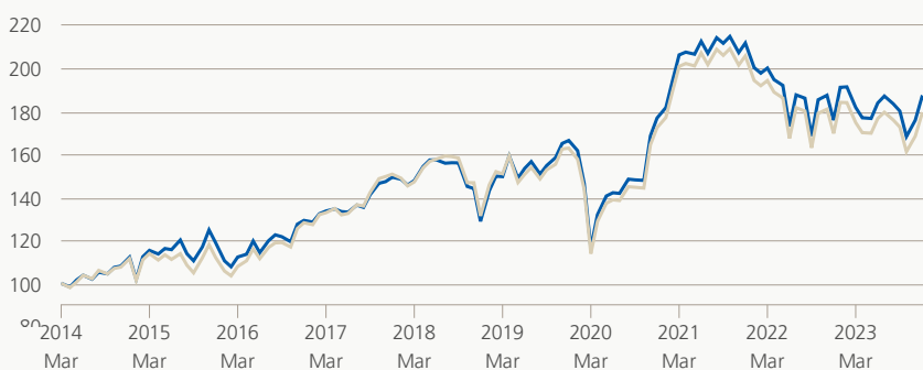
Performance (gross of fees, indexed)

■ Zurich investment foundation ■ Benchmark