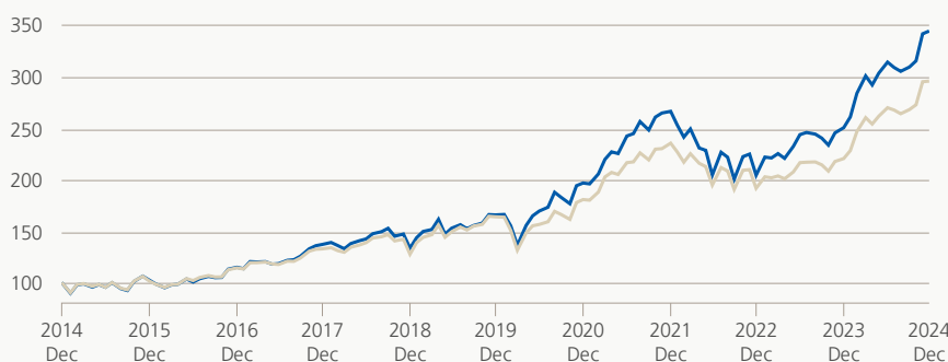
Performance (gross of fees, indexed)

■ Zurich investment foundation ■ Benchmark