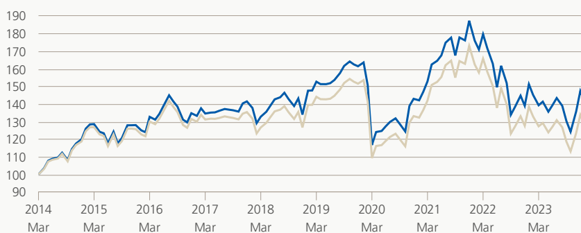
Performance (gross of fees, indexed)

■ Zurich investment foundation ■ Benchmark