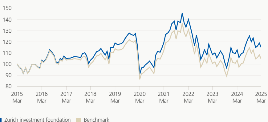
Performance (gross of fees, indexed)

The investment group tracks the FTSE EPRA/NAREIT Developed Rental Index. Listed real estate companies can be part of this index if their rental revenue from investment properties is at least 70% of total revenue. The investment group is hedged to 100% in CHF.