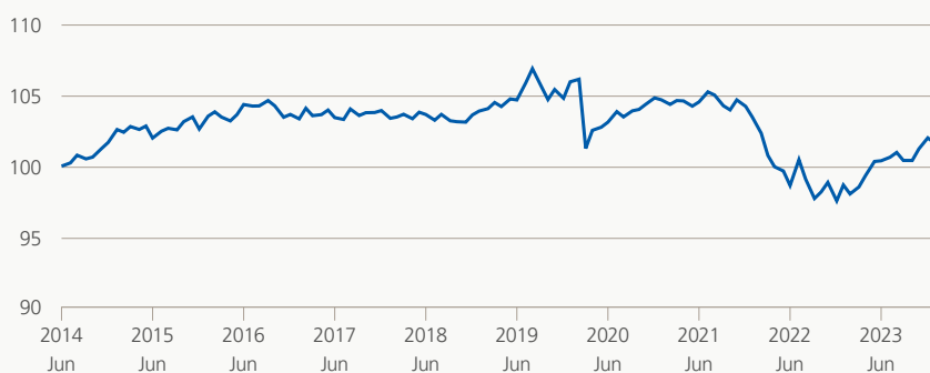
Performance (gross of fees, indexed)

The portfolio invests preferably in fixed-interest securities of first-class Swiss issuers denominated in Swiss francs. Not more than 10% of the portfolio may be invested in securities from the same debtor. This excludes debt owed by the Swiss Confederation, cantons, banks and insurance companies with their statutory head office in Switzerland.