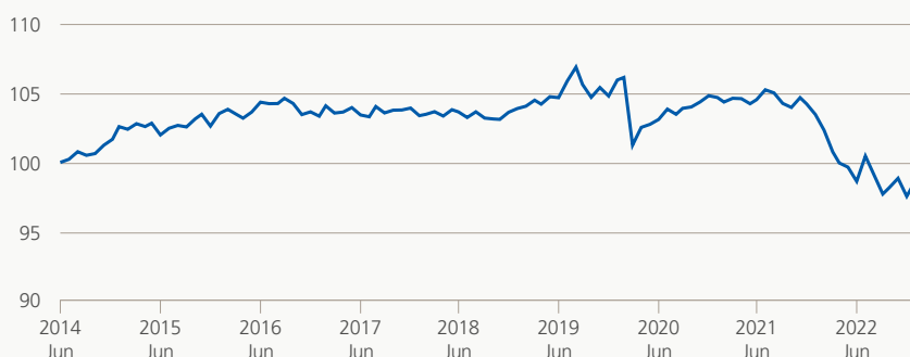
Performance (gross of fees, indexed)

The portfolio invests preferably in fixed-interest securities of first-class Swiss issuers denominated in Swiss francs. Not more than 10% of the portfolio may be invested in securities from the same debtor. This excludes debt owed by the Swiss Confederation, cantons, banks and insurance companies with their statutory head office in Switzerland.