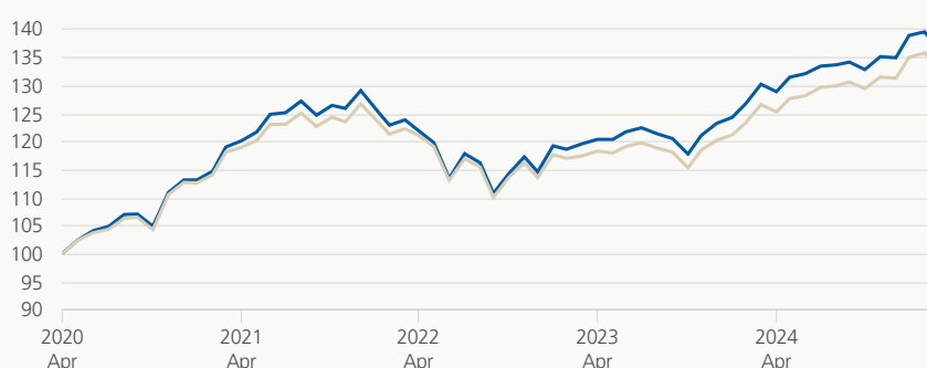
Performance (gross of fees, indexed)

■ Zurich investment foundation ■ Benchmark