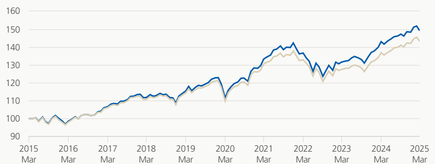
Performance (gross of fees, indexed)

■ Zurich investment foundation ■ Benchmark