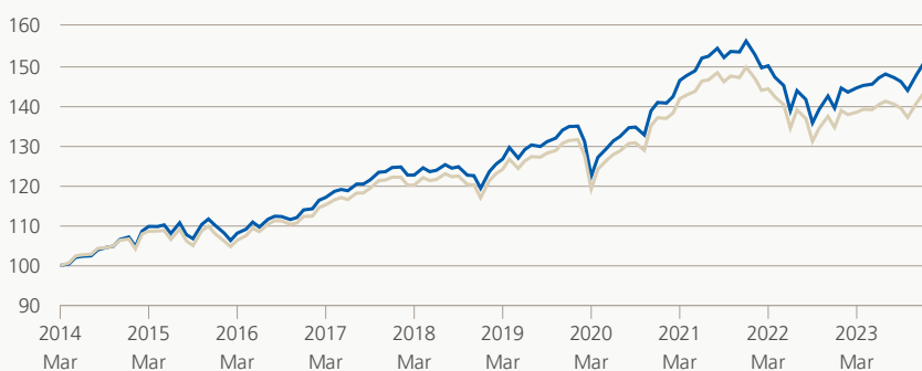
Performance (gross of fees, indexed)

■ Zurich investment foundation ■ Benchmark