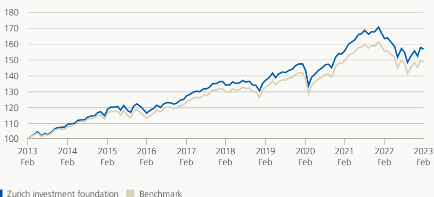
Performance (gross of fees, indexed)

The investment objective of is to optimize returns while maintaining a specific value fluctuation reserve. The strategies may include alternative investments in addition to traditional asset classes such as equities, capital market, real estate and mortgages.