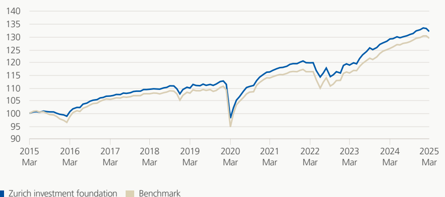
Performance (gross of fees, indexed)

The investment group is broadly diversified investing in European and US senior loans. The maximum allocation to an individual debtor is 3 percent with diversification across at least 75 debtors. In addition the portfolio is completely hedged in Swiss francs.