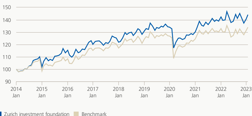
Performance (gross of fees, indexed)

The investment group is broadly diversified investing in European and US senior loans. The maximum allocation to an individual debtor is 3 percent with diversification across at least 75 debtors.