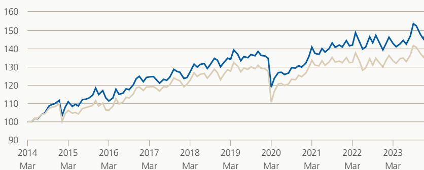
Performance (gross of fees, indexed)

■ Zurich investment foundation ■ Benchmark