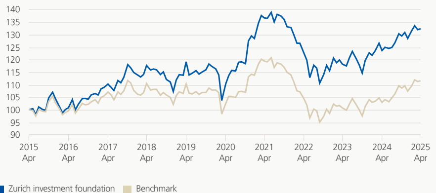
Performance (gross of fees, indexed)

The investment group predominantly invests in globally diversified convertible bonds. The minimum average rating of the portfolio must be at least equivalent to an investment grade of one of the leading rating agencies. Not more than 10% of the portfolio may be invested in securities of the same debtor. The foreign currency risk is hedged against CHF.